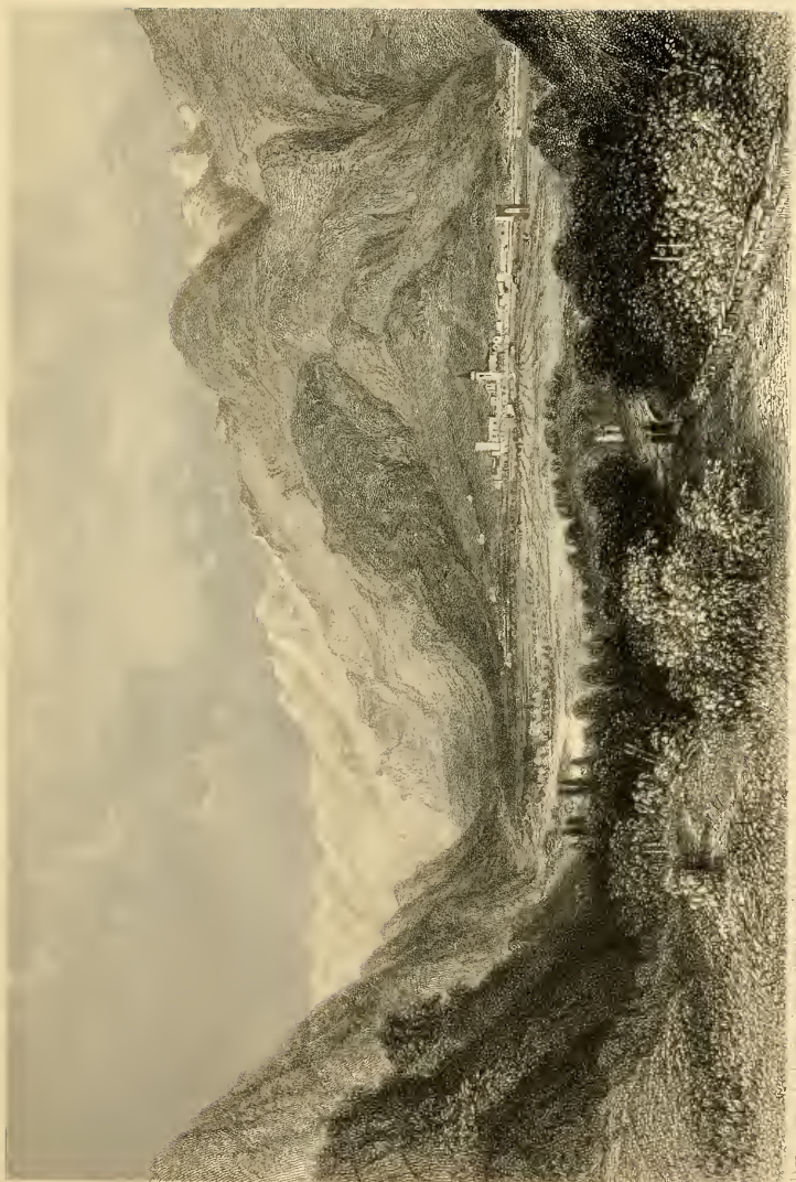
View of the Mountains near the City of Mexico from the Plaza de San Juan de los Rios