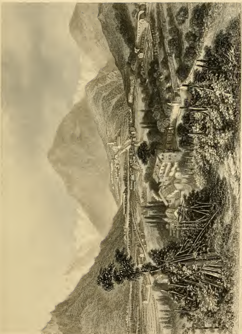
View of the City of Mexico from the Mountains