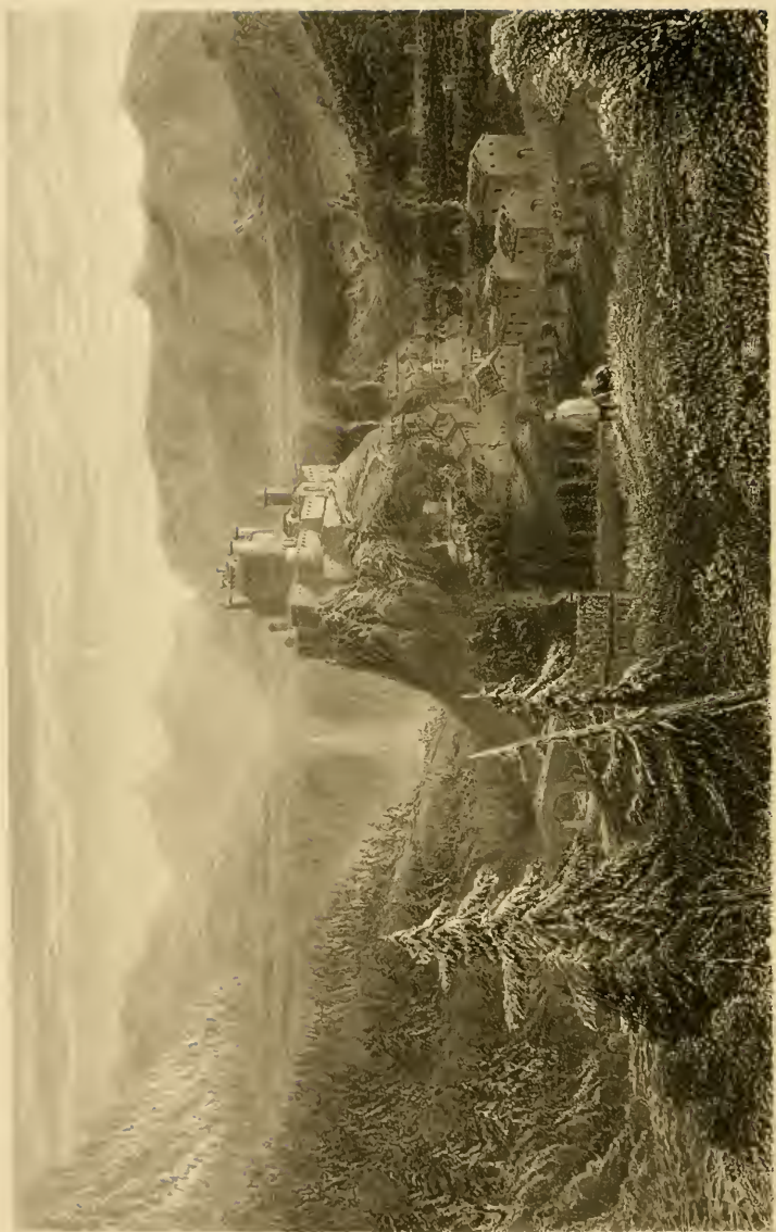
THE MOUNTAIN HOUSE, MOUNTAIN VIEW, CALIFORNIA