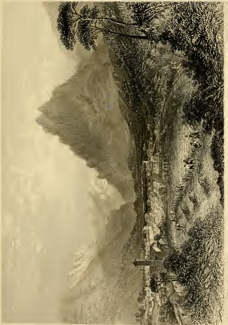
VIEW FROM THE TOWER OF ST. MARTIN'S CHURCH, BOURNEMOUTH, ENGLAND.